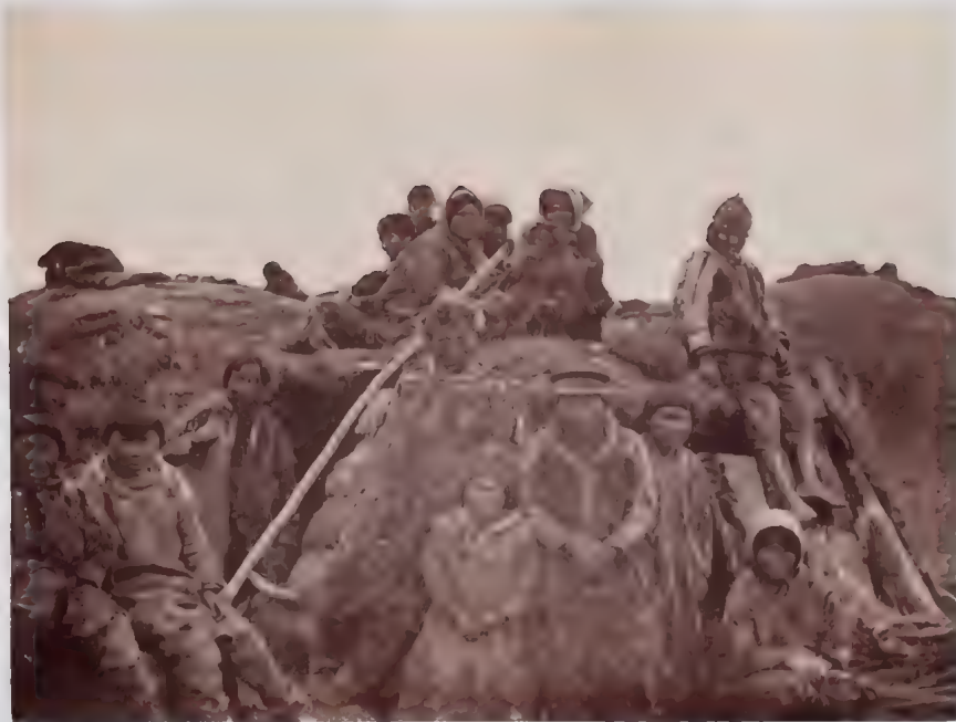
| 13. Group of Esquimaux and Dwelling.